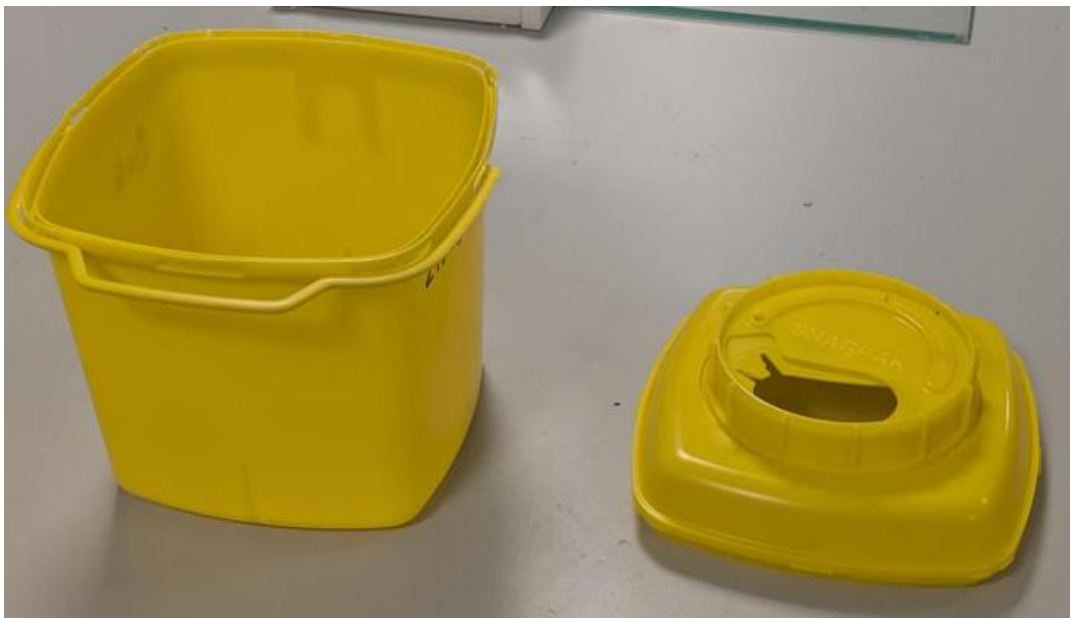
Figure 1 Example of container and lid as received

The results in this report relate only to the materials supplied.